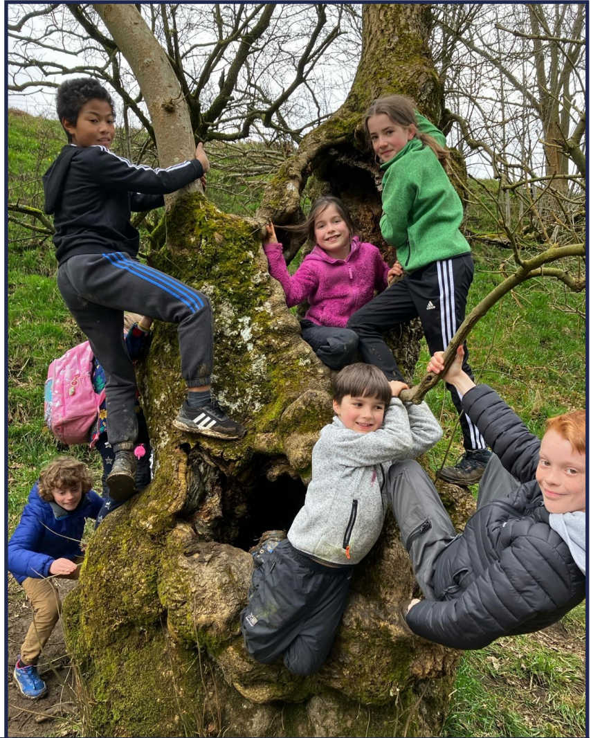
Photo of the Week: An exciting week of adventure and fun during the Easter Holidays for our Holiday School pupils. You find out the dates for forthcoming Holiday Schools in this edition.

Head's Challenge: What has 13 hearts, but no other organs?