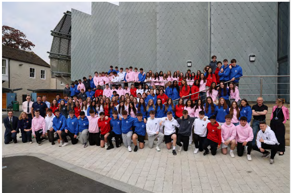
Our 5th Year Leavers 2024 - more photos inside!