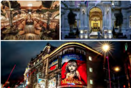
West End Show with Lunch and One Night Stay for Two

The auction will finish on the evening of our Summer Ball - but don't worry, if you are not attending the ball then you can still take part!