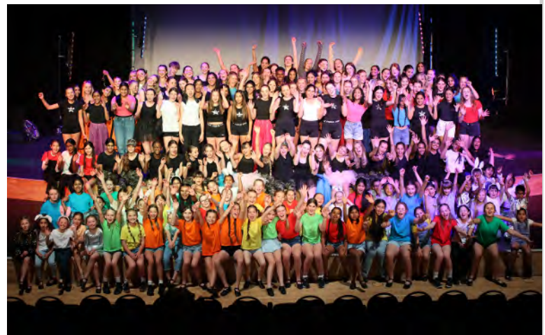
All of our dances taking part in the Dance Showcase