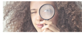
Learning Through Intrigue