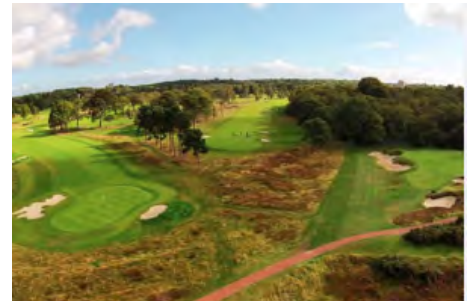
4 Ball of Golf at Moortown Golf Club

Good luck to all our bidders and thank you to bidders and prize donors for supporting CRY.