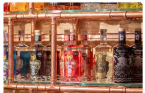
Hooting Owl Gin tour for 4 people