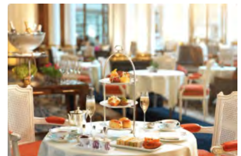
Champagne Afternoon Tea for Two