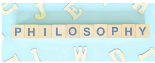
Philosophy For Children