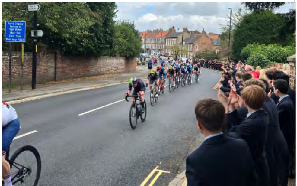
The Tour of Britain sped past our entrance gates on Wednesday!