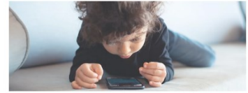
Young Children and Screens