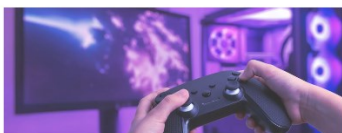
The Truth About Gaming