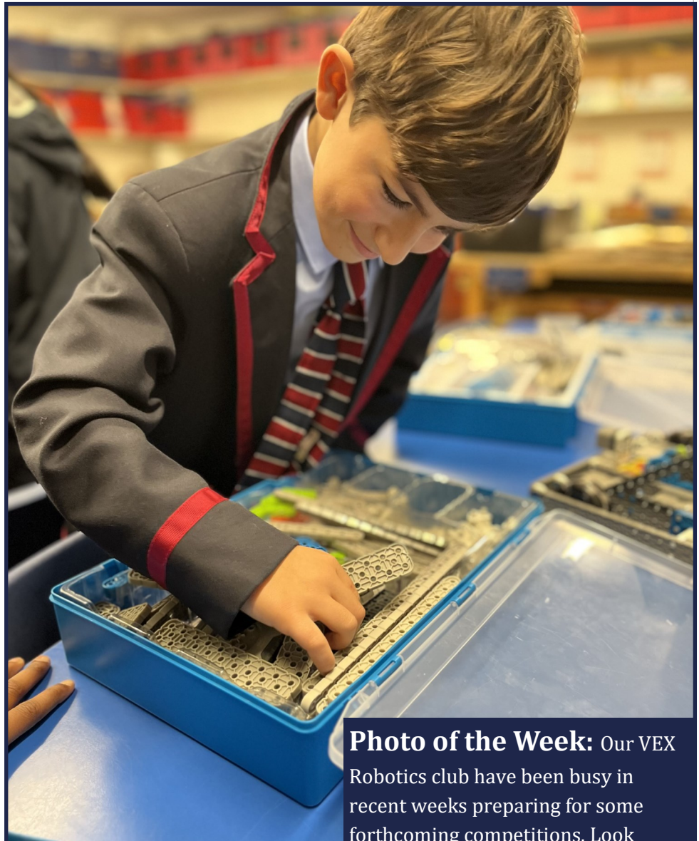
Photo of the Week: Our VEX Robotics club have been busy in recent weeks preparing for some forthcoming competitions. Look inside for a sneak peak at what they have been up to.