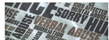
Gender-Based Violence: What Parents Need To Know