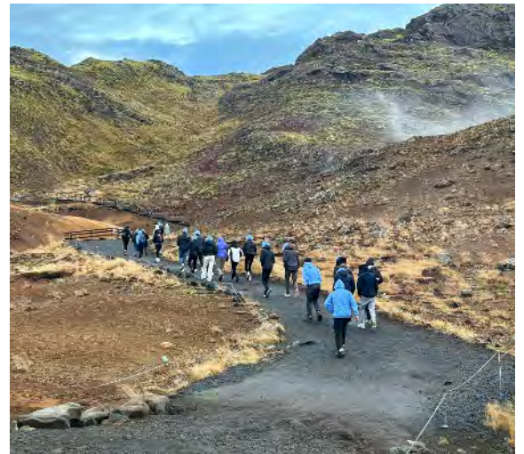
The amazing Iceland trip!