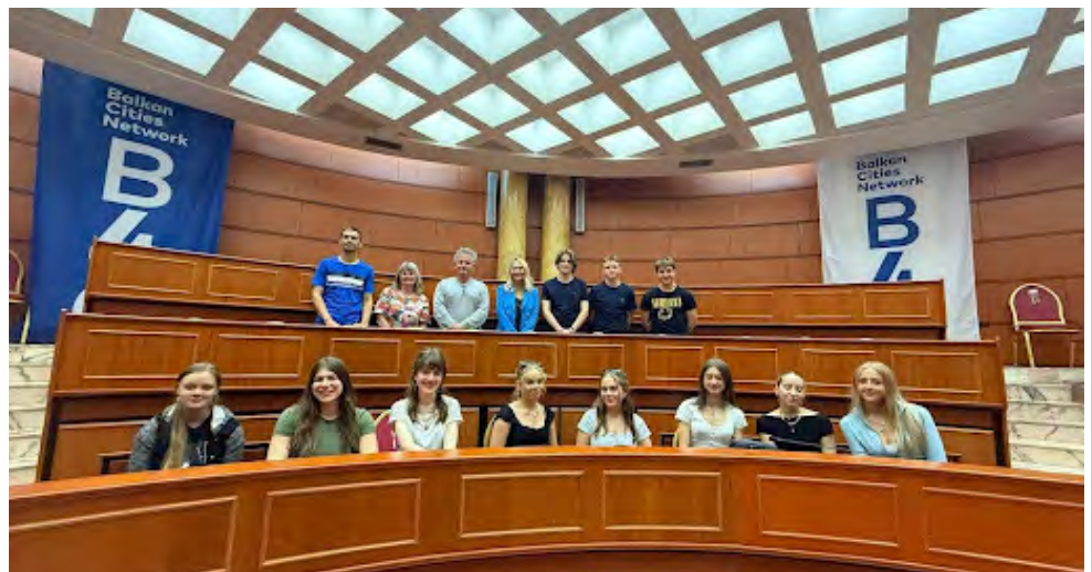
Students at the Mayoral Office in City Hall with Deputy Mayor of Tirana, Anuela Ristani