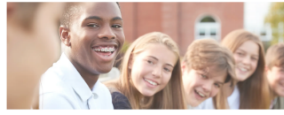
Living Joyfully and Successfully with ADHD