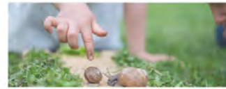
Cultivating Young Children's Curiosity

Don't forget to follow us on social media to stay up-to-date with all of our latest updates and resources. Find us on Facebook , Instagram , Twitter , and LinkedIn .