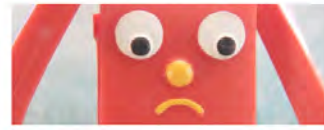
Learning Tips From Philosophy