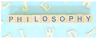
Philosophy For Children