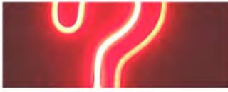
Doing Philosophy With Children Podcast