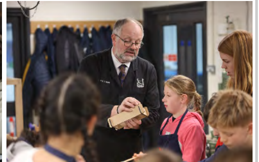
Year 6 pupils from Prep School visited for a taster session!