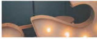
Unlocking Children's Thinking