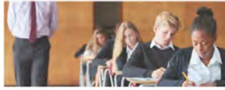
Exam Planner 2025