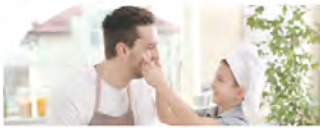
Children's Relationship with Food