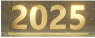
2025 Goal-Setting Planner