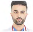
Debunking Health and Fitness Myths

Remember to follow us on social media to stay up-to-date with all of our latest updates and resources. Find us on Facebook , Instagram , Twitter , and LinkedIn .