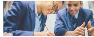
Strategies to Beat Procrastination