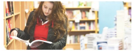
Brilliant New Fiction for World Book Day 2025